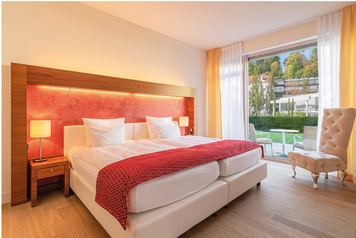
Aqua Aurelia Suitehotel & Doormanhouse | Aqua Aurelia Suitehotel & Doormanhouse